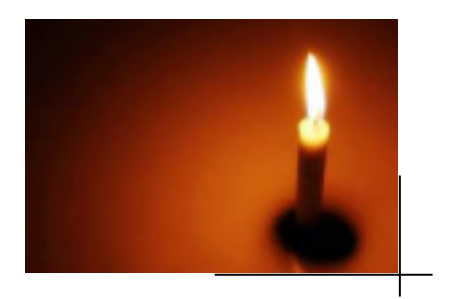
All people who seek means of satisfaction outside must be disappointed at the end